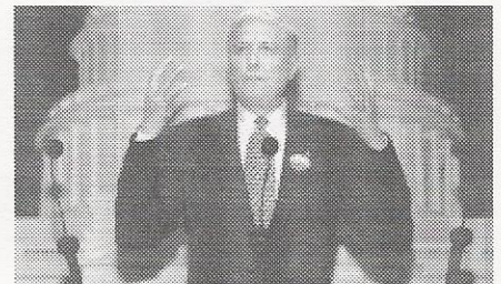
Harry Browne, prospecting the convention delegates for the 2000 presidential nomination.

Platform changes were limited to planks on The Economy, Sexual Rights, Freedom of Association and Government Discrimination, Health Care, Transportation, American Indian Rights, Trade and The Economy, Crime, and Freedom and Responsibility. The convention ran out of time while discussing the Family Life plank. Thirteen other planks which had been scheduled for debate were not even considered.